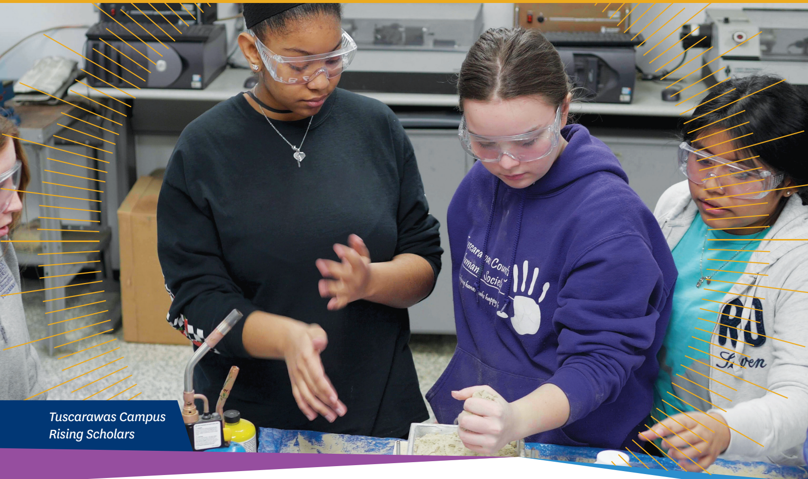
Tuscarawas Campus Rising Scholars