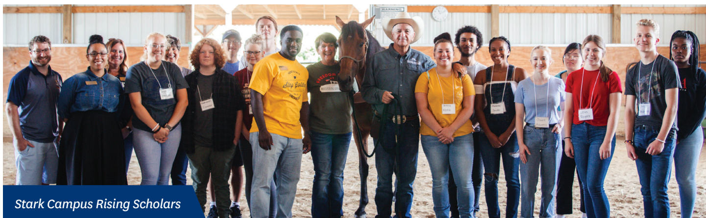
Stark Campus Rising Scholars

For more information or to discuss a philanthropic gift, please contact us at advancement@kent.edu or 330-672-2222.